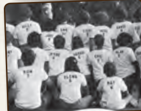
THE 5-YEAR CLUB 1980